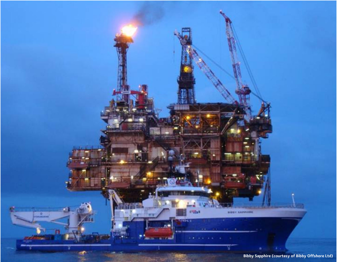
Bibby Sapphire